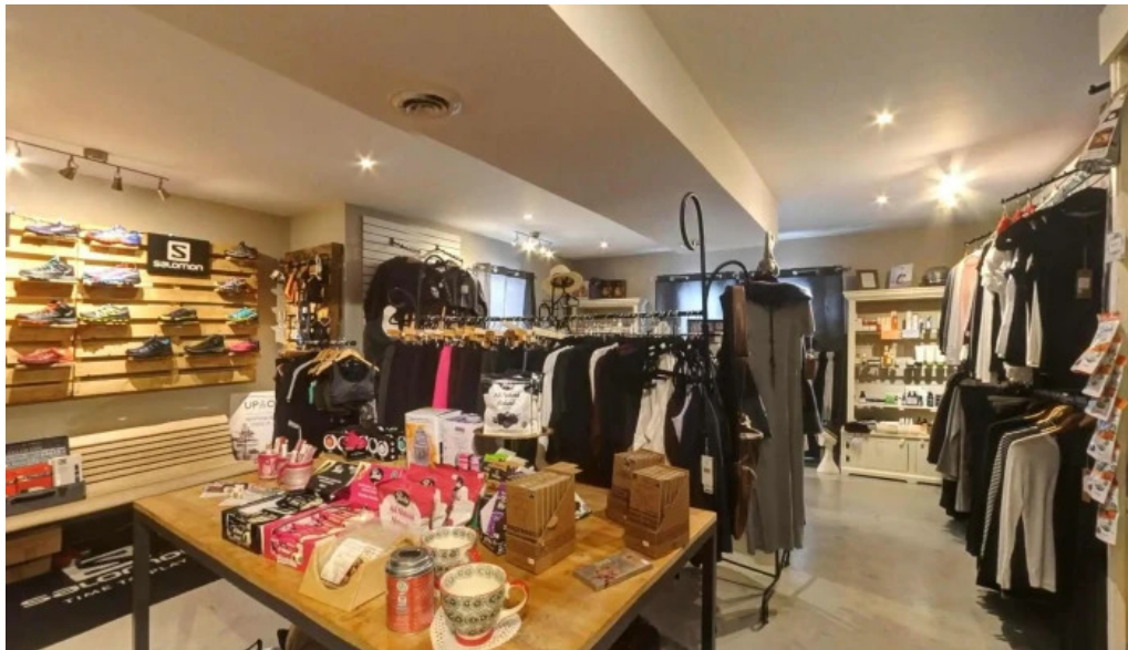
Kind living all