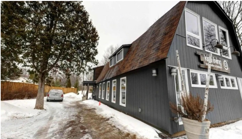
Kind living street view 360deg