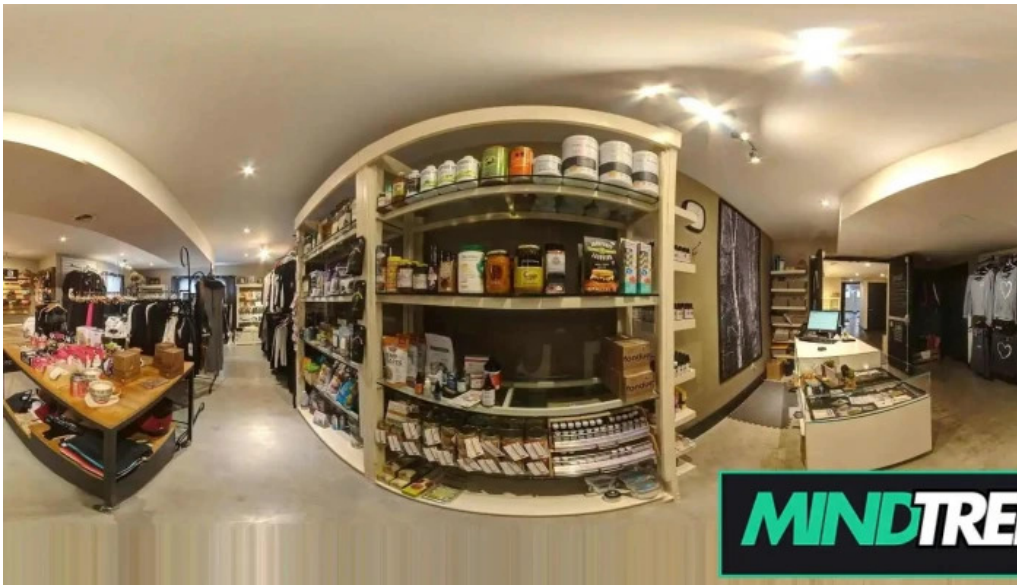
Kind living orillia