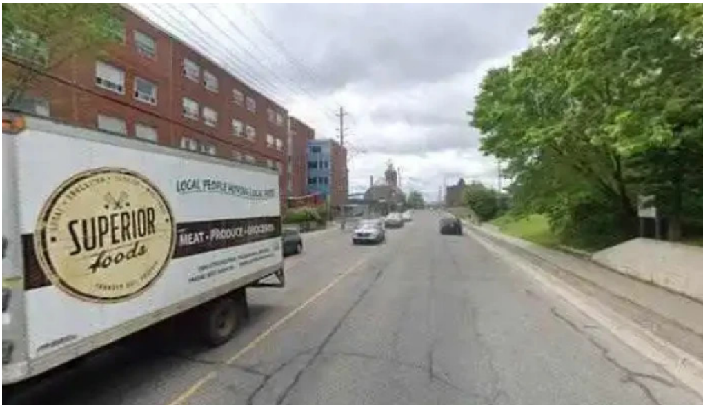
St josephs care group street view 360deg