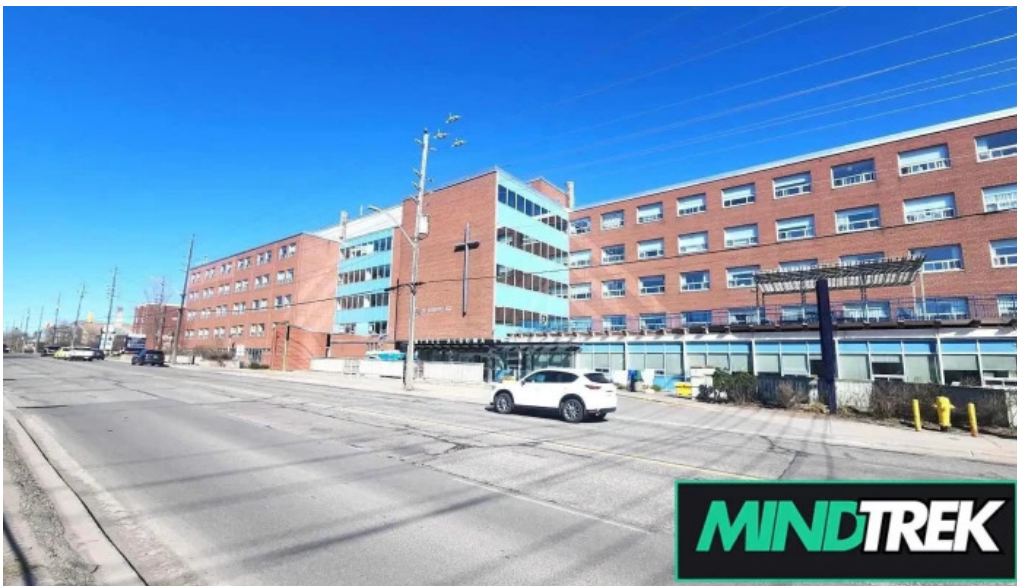
St joseph s care group thunder bay