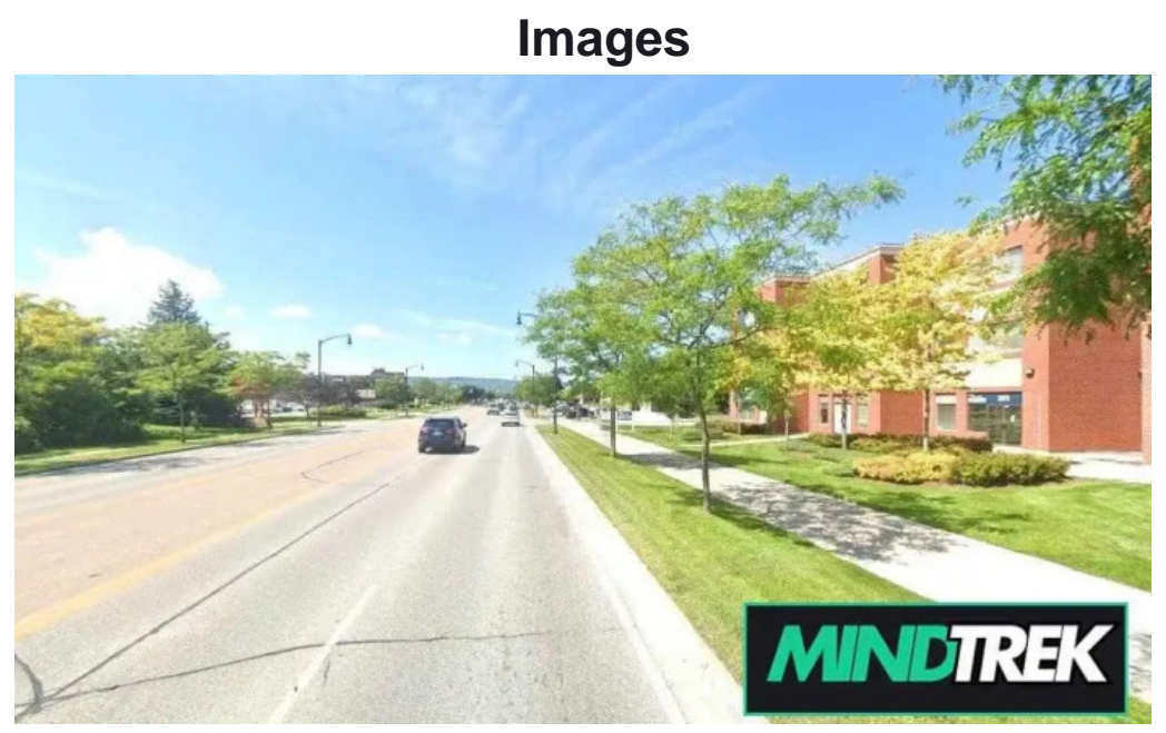
Collingwood speech therapy collingwood

If you wish to alter any information that you think is not correct about this page, we ask send us a message and we will adjust it quickly. With anticipation we appreciate it.