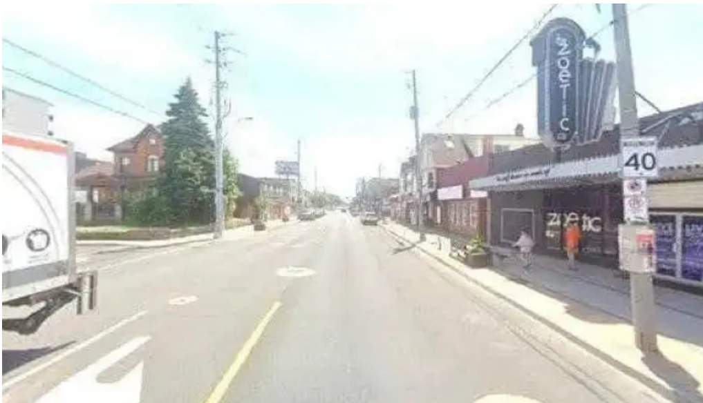
Andrea zahra therapy and counselling services street view 360deg