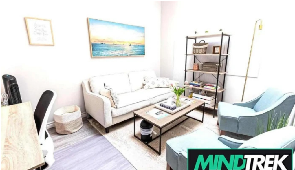
Ocd wellness barrie