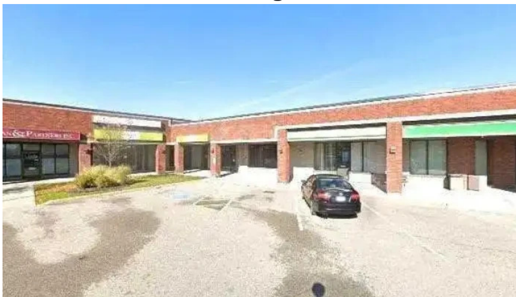
Ocd wellness street view 360deg