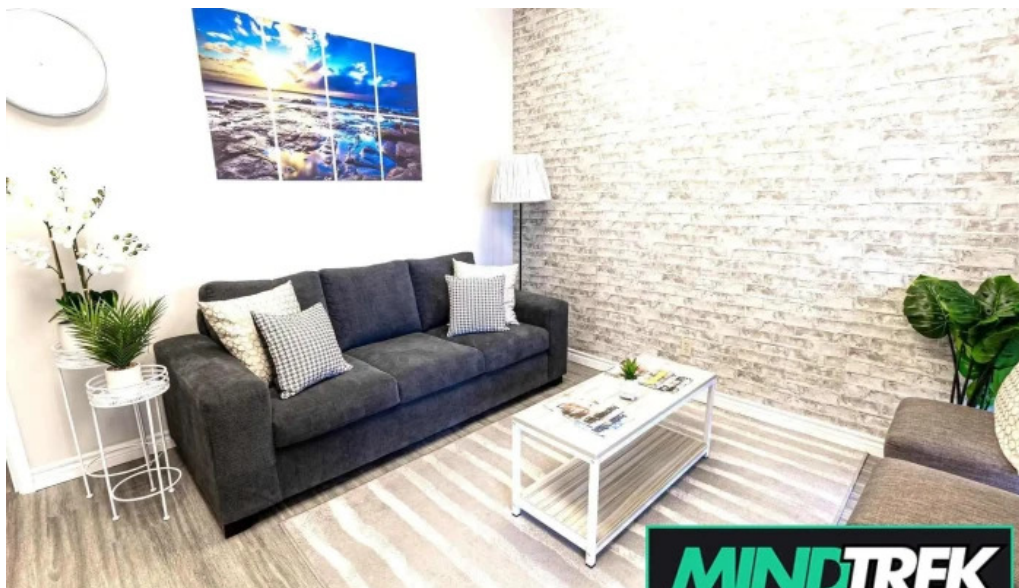
Ocd wellness by owner