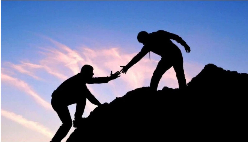
Gama coaching and therapy by owner