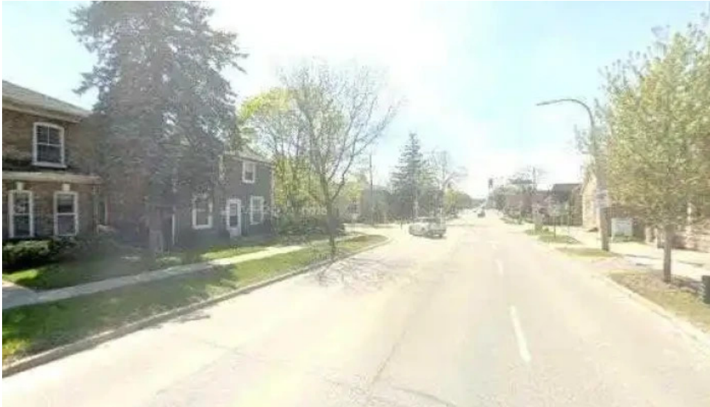
Gama coaching and therapy all