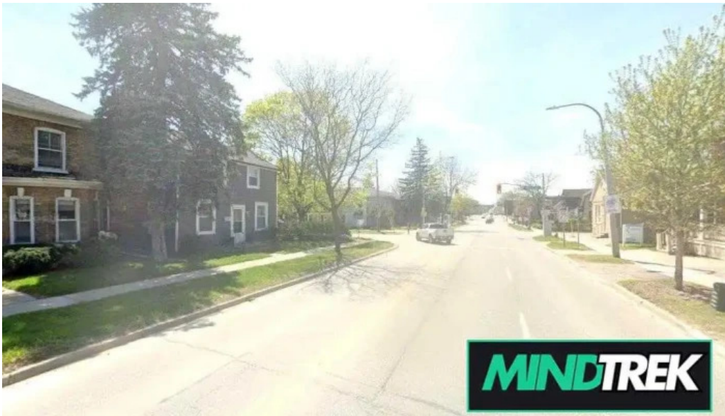
Gama coaching and therapy aurora