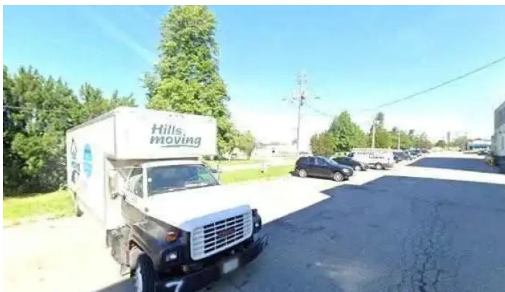
Hope psychotherapy and consulting all