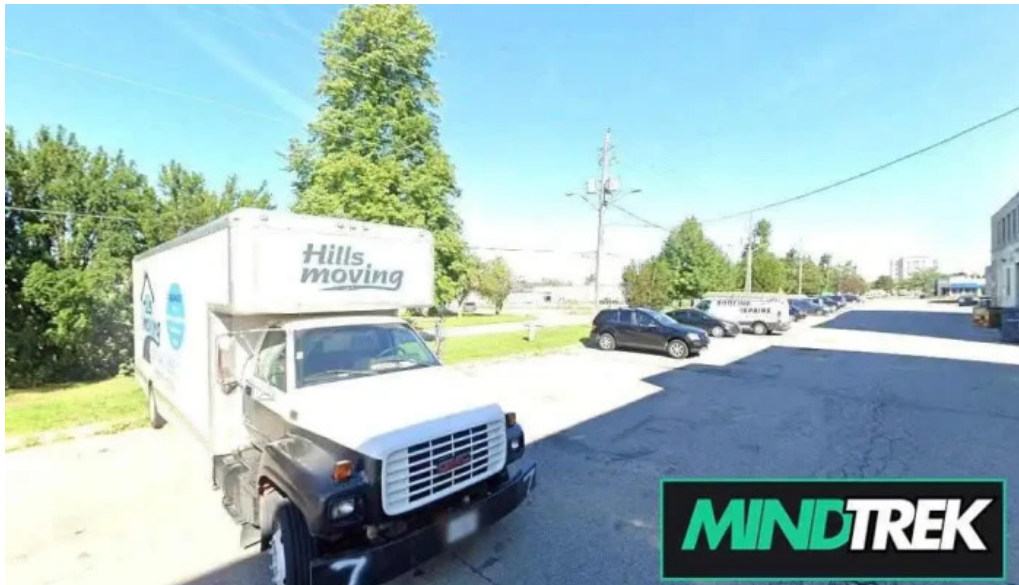
Hope psychotherapy and consulting ajax