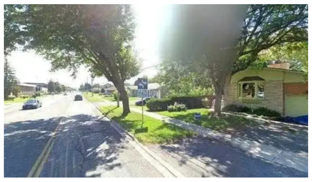
Equipe psycho sociale pour enfants adolescents francophones s d g all