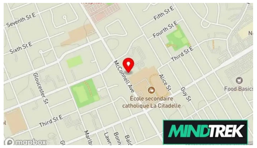
Equipe psycho sociale pour enfants adolescents francophones s d g map