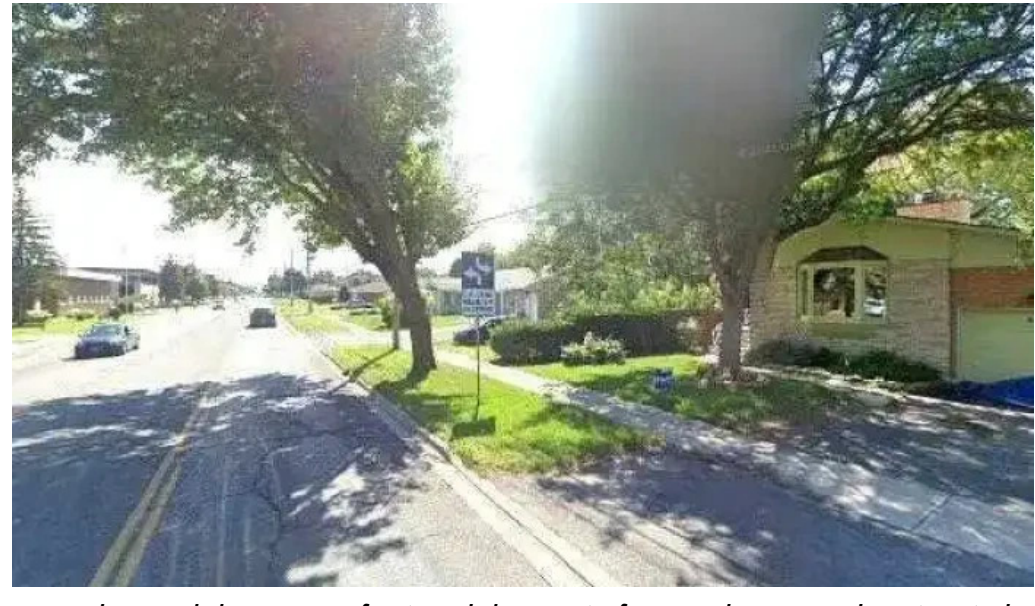
Equipe psycho sociale pour enfants adolescents francophones s d g street view 360deg