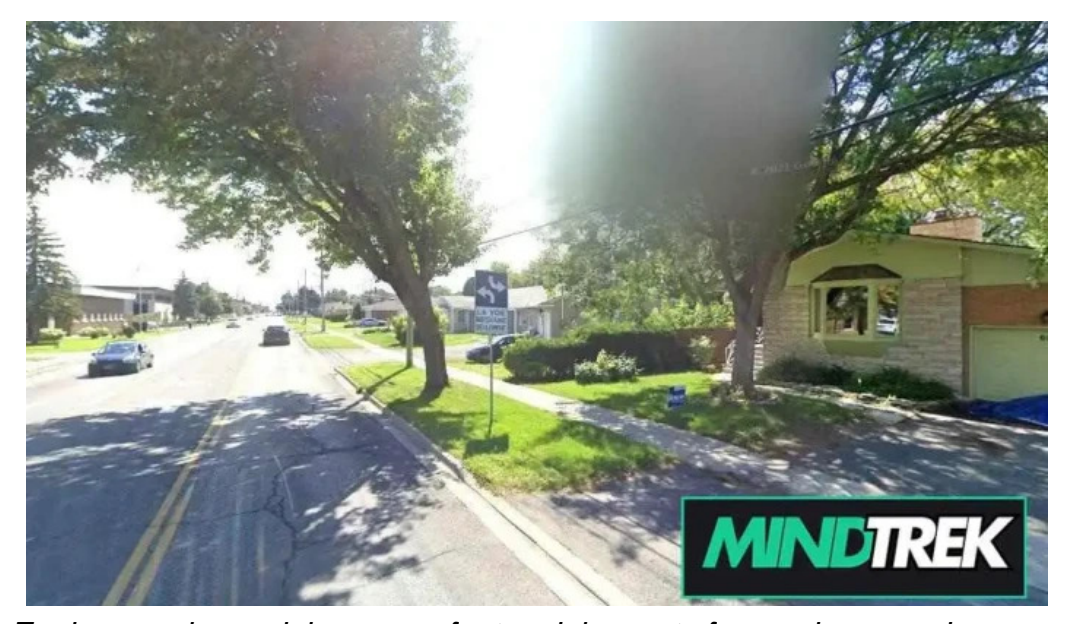
Equipe psycho sociale pour enfants adolescents francophones s d g cornwall