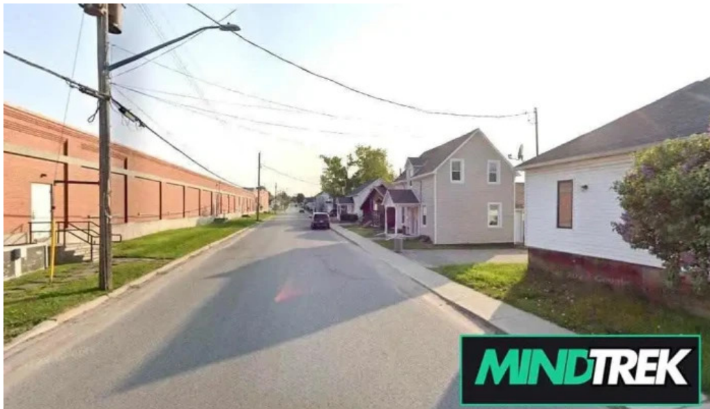
Phoenix centre for children families arnprior