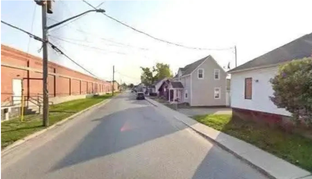
Phoenix centre for children families all