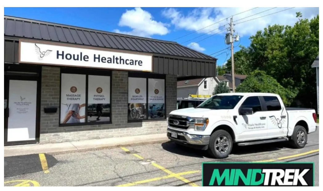
Houle healthcare carleton place