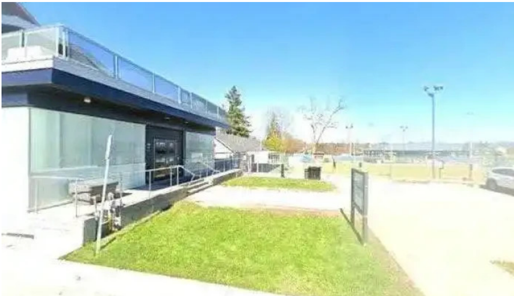
Melissa pim counselling all