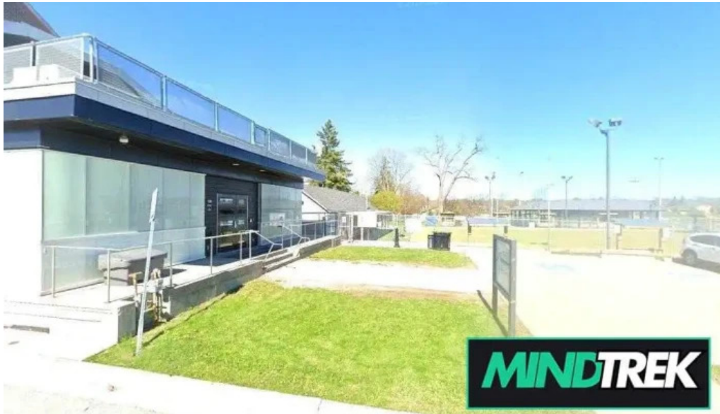
Melissa pim counselling whitchurch stouffville