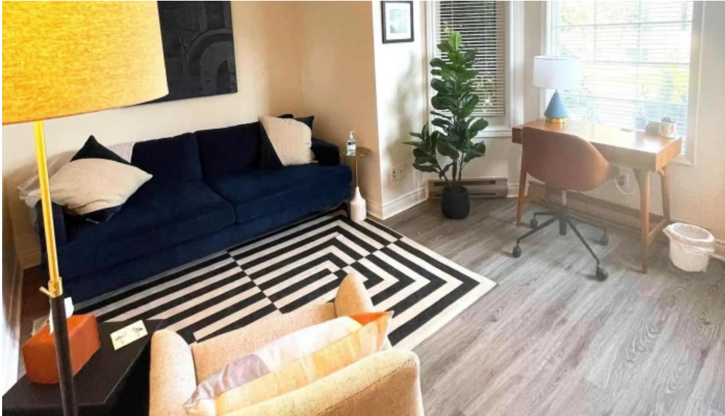
Vault mental health all