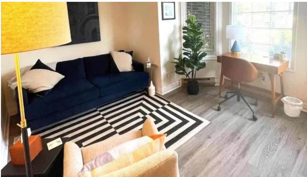
Vault mental health whitby