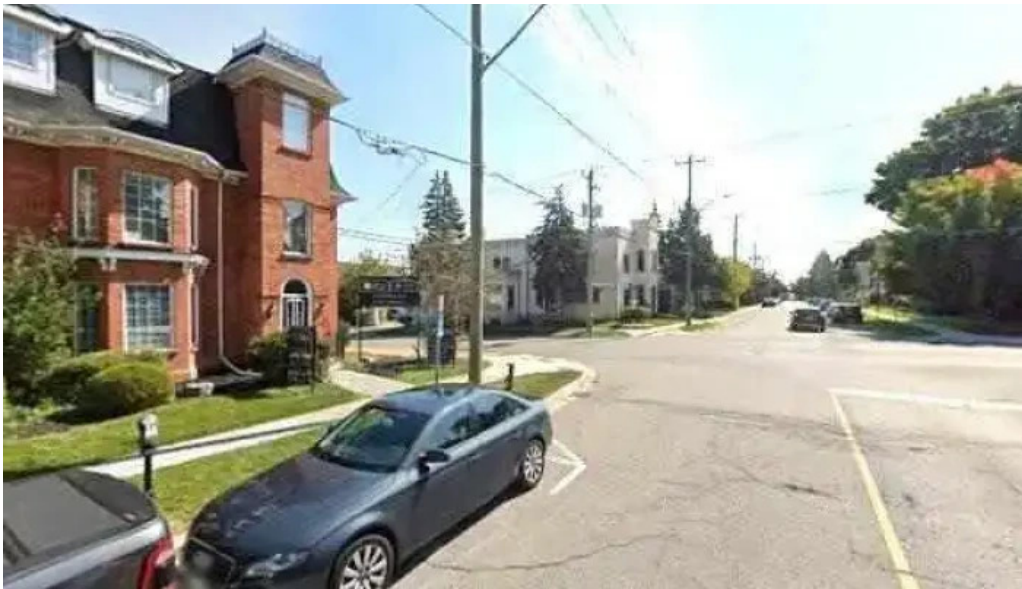
Vault mental health street view 360deg