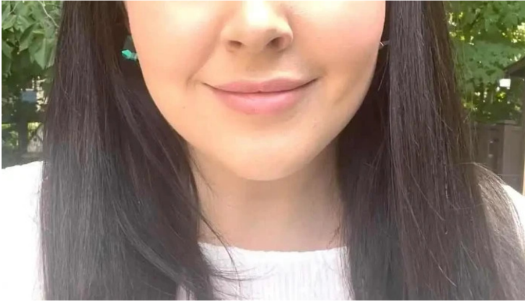
Vault mental health videos