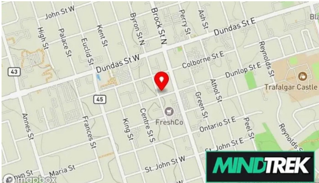
Vault mental health map