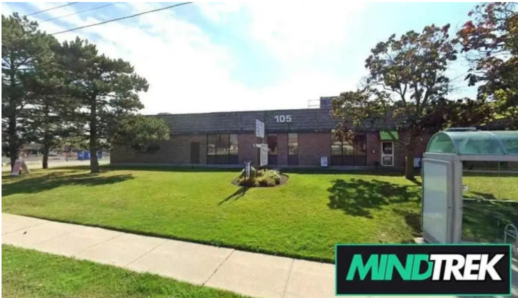
Restoration room counsellors whitby