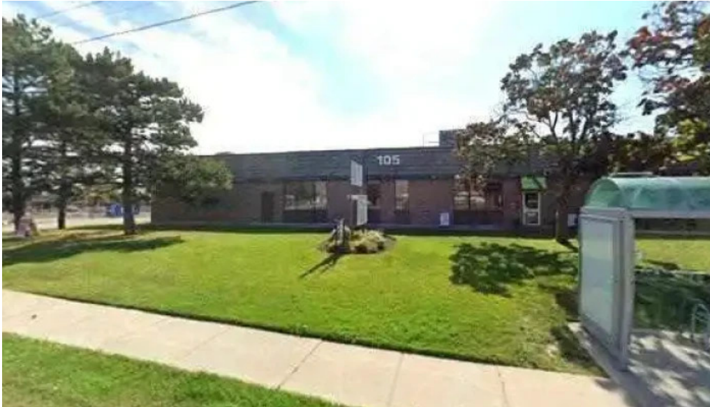
Restoration room counsellors all