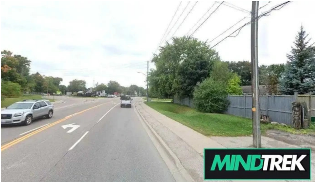
Inward mental health whitby