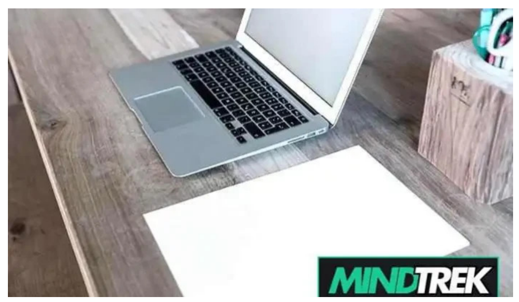
Impart therapy by owner