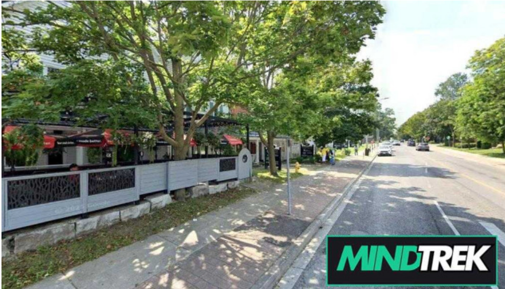
Hs therapy healing space whitby