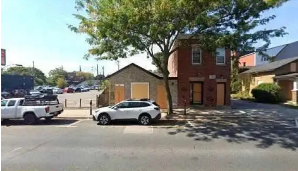
Beacon of hope counselling all