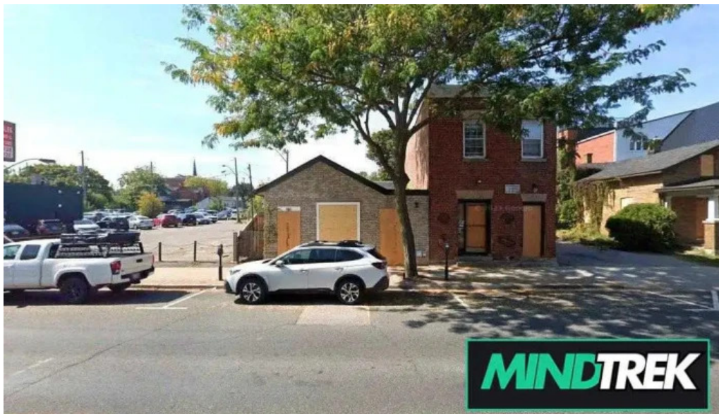
Beacon of hope counselling whitby