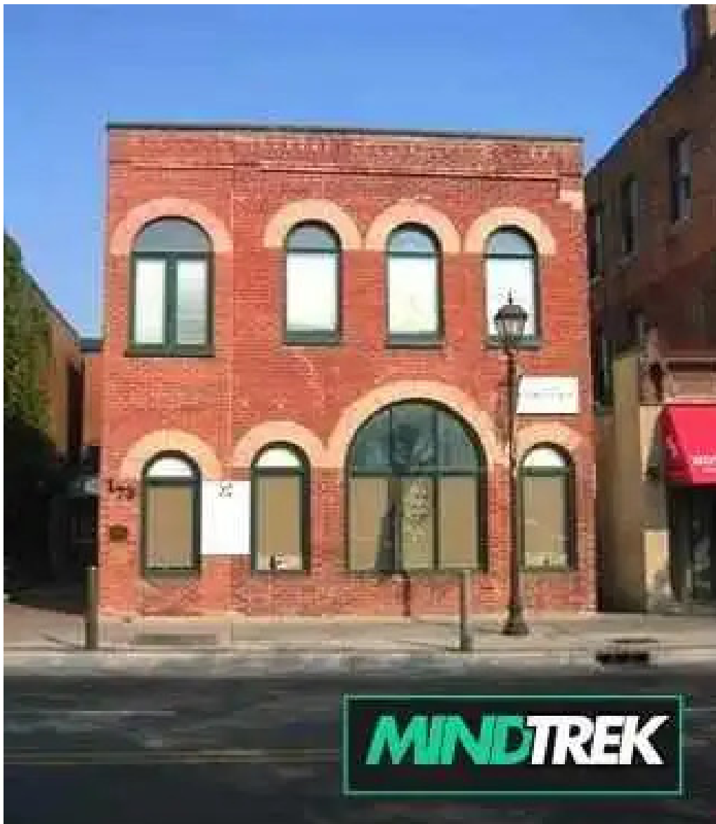
Beacon of hope counselling by owner