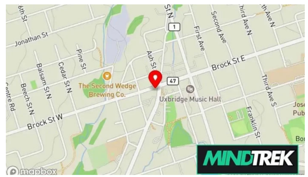
Garfinkel therapy map