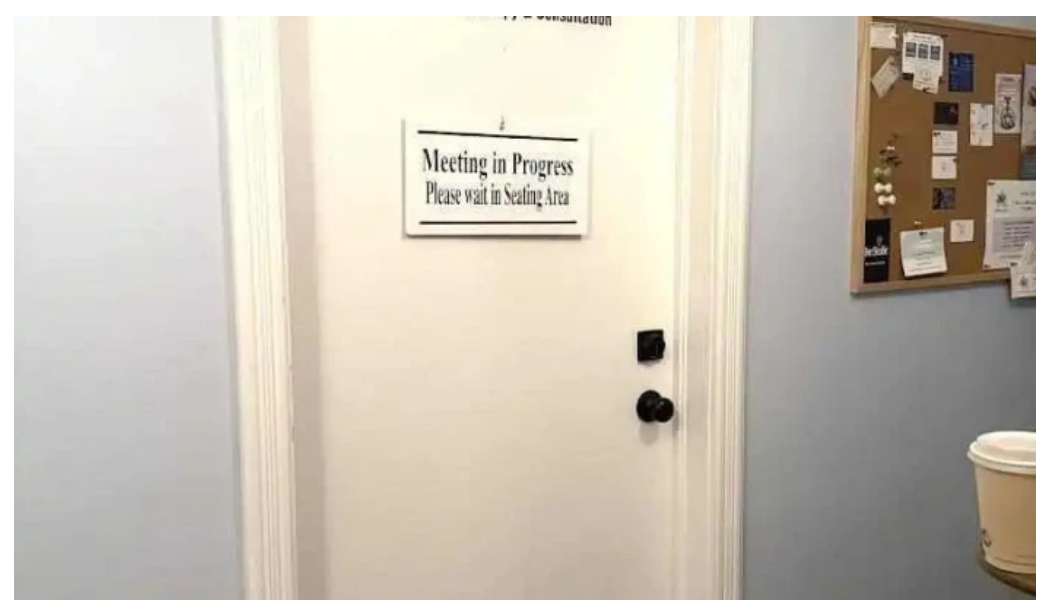
Garfinkel therapy uxbridge