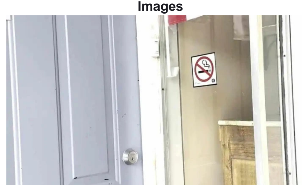
Garfinkel therapy videos

If you require to change any detail that you think is incorrect regarding this page, we urge you to deliver a message so we can we will correct it promptly. Thanks beforehand we appreciate it.