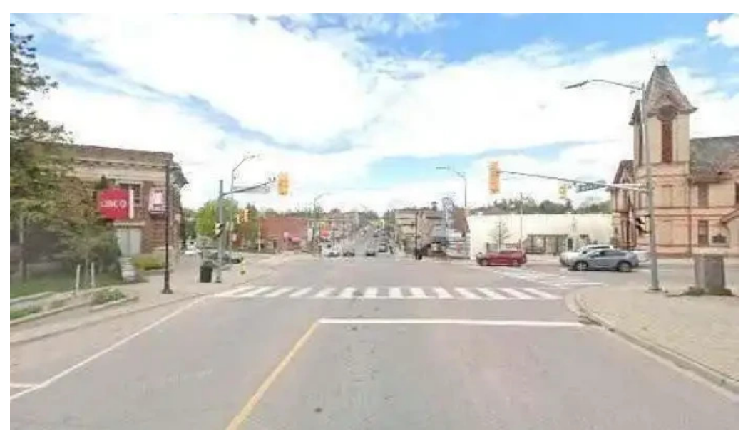
Garfinkel therapy street view 360deg