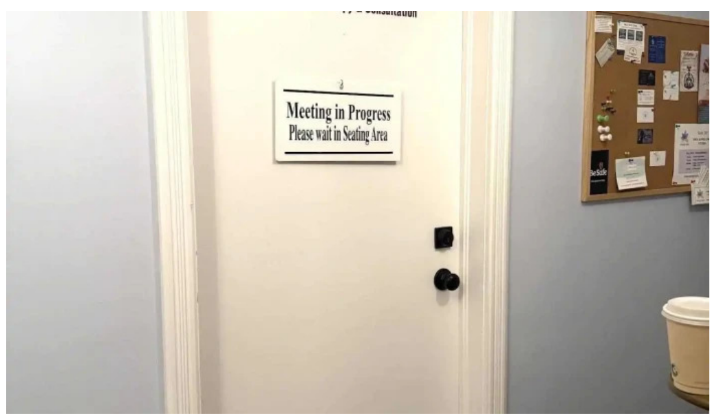
Garfinkel therapy all