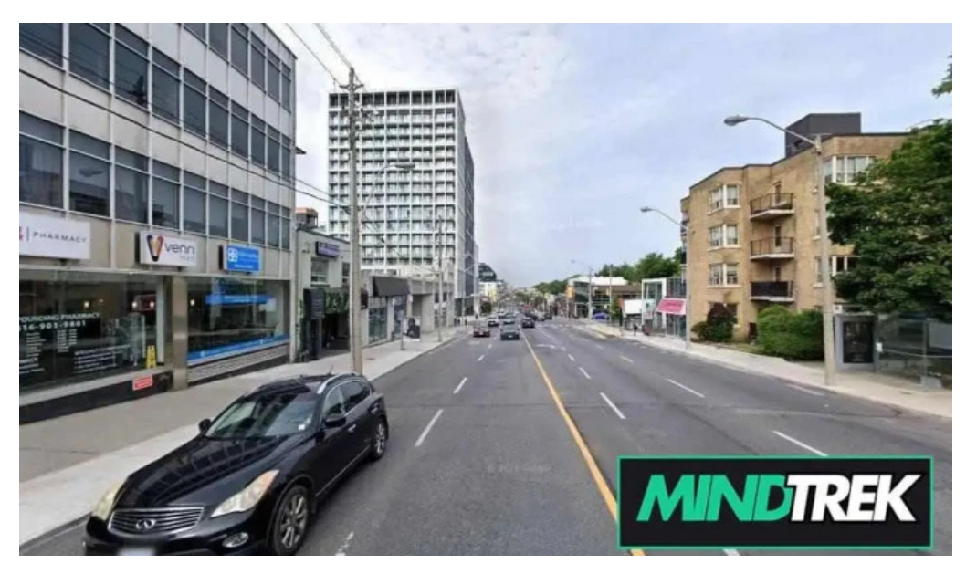
Leaside therapy group toronto