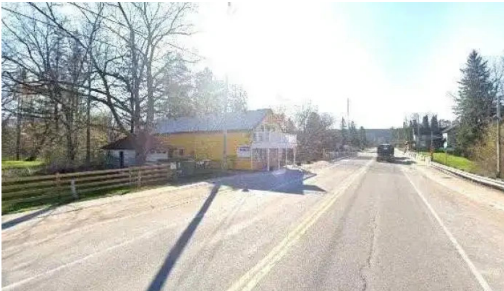
North simcoe therapy network all