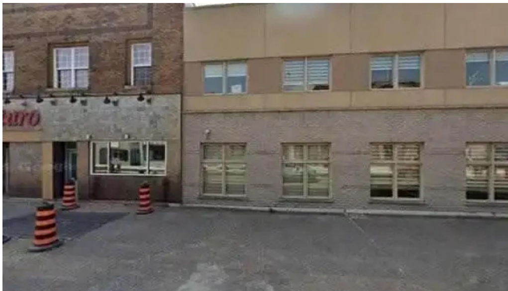
Patricia lebel hope and healing counselling all