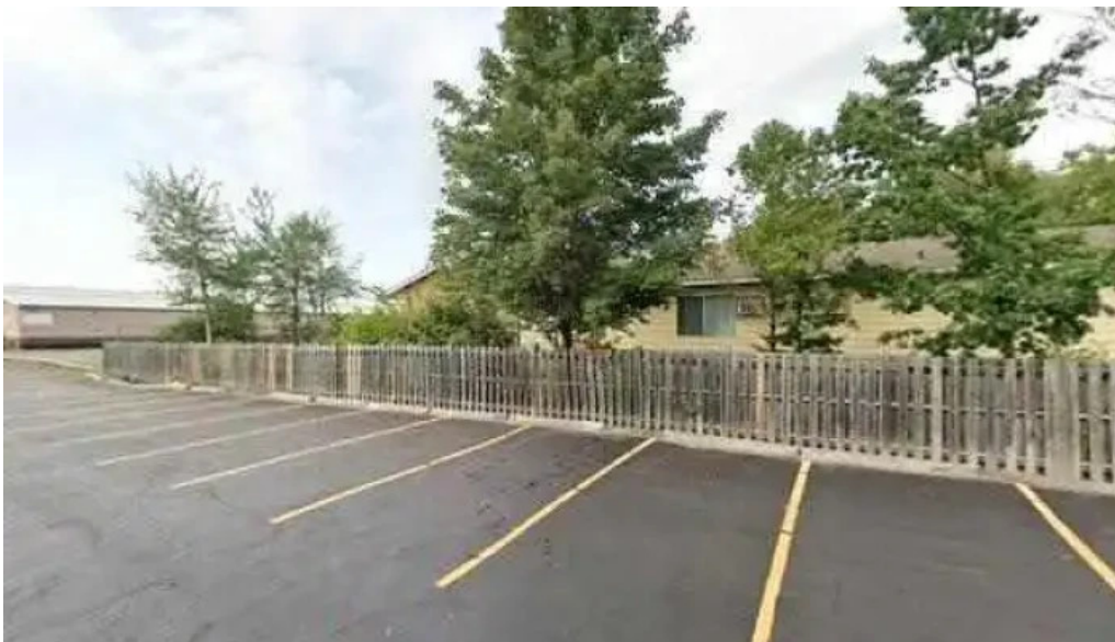
Karalash counselling psychotherapy individual couple family therapy street view 360deg