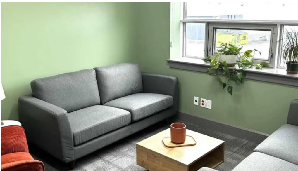
Karalash counselling psychotherapy individual couple family therapy all