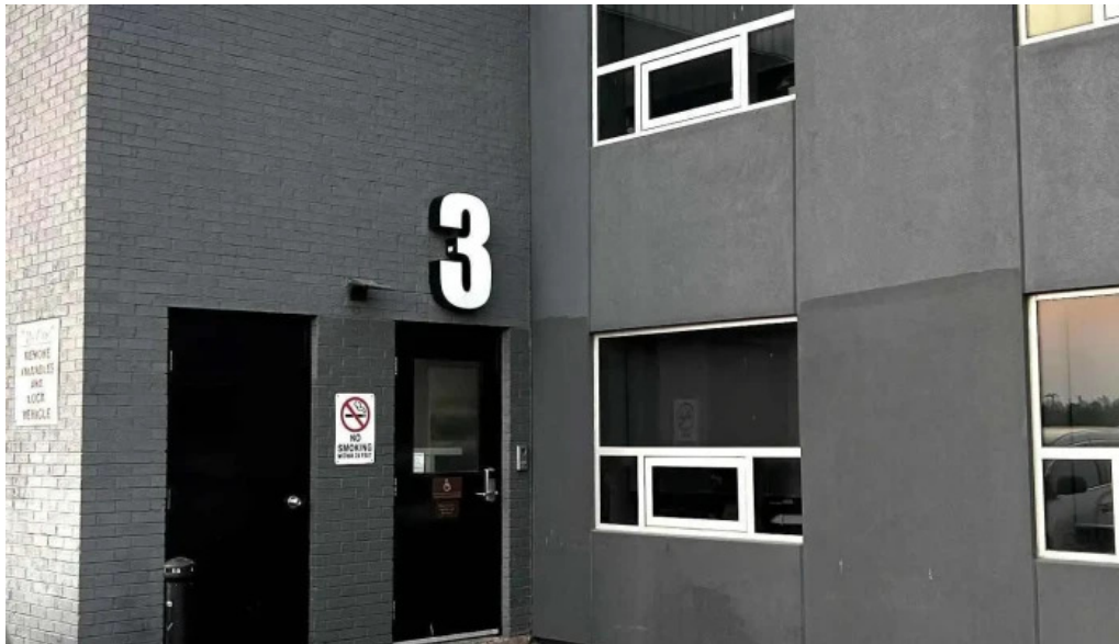
Karalash counselling psychotherapy individual couple family therapy by owner