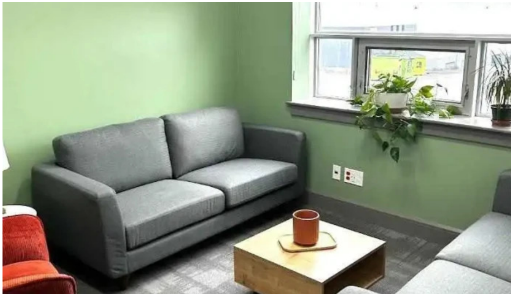
Karalash counselling psychotherapy individual couple family therapy sault ste marie