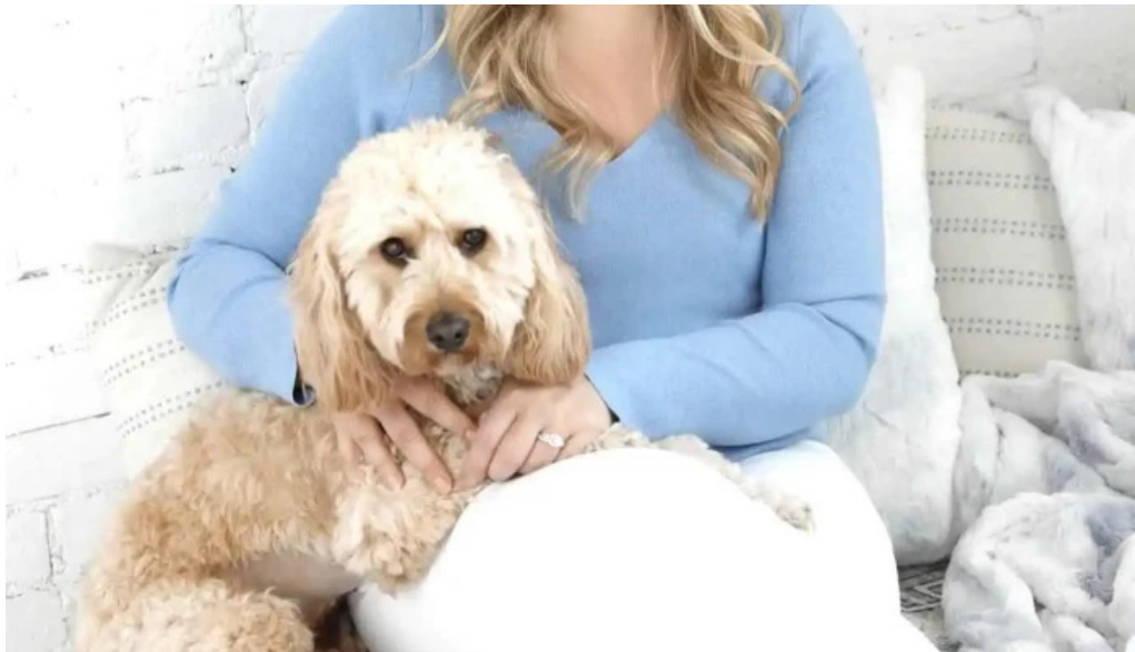
Whitehouse psychotherapy by owner