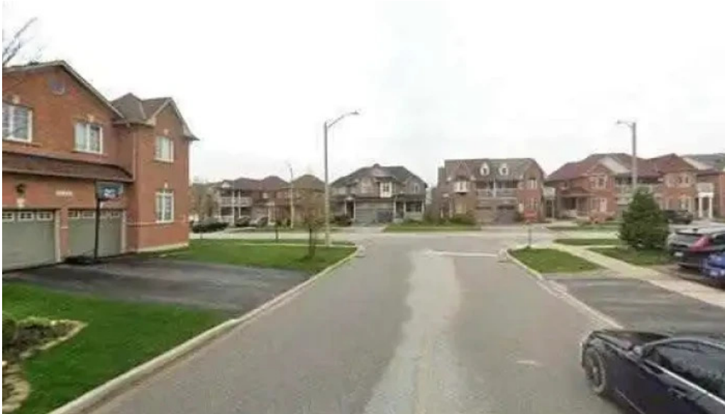
Whitehouse psychotherapy street view 360deg