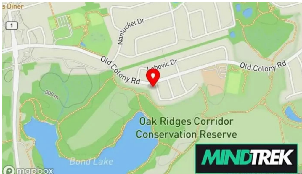
Whitehouse psychotherapy map