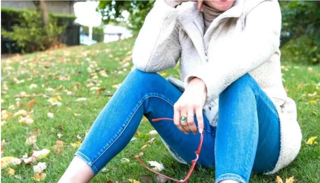
Pickering counseling centre by owner