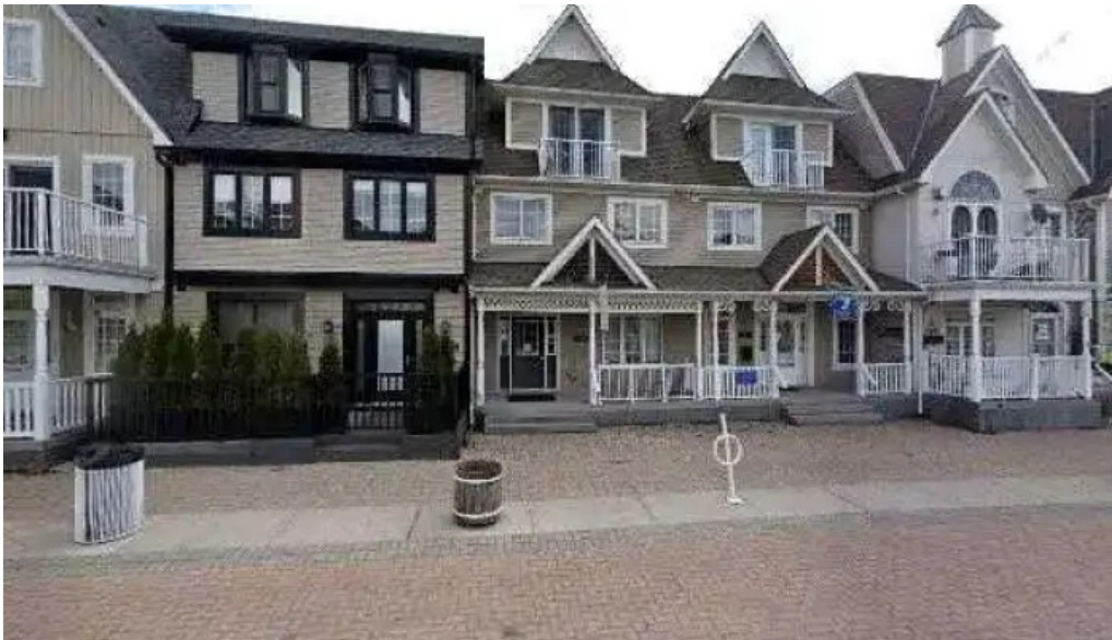
Pickering counseling centre all