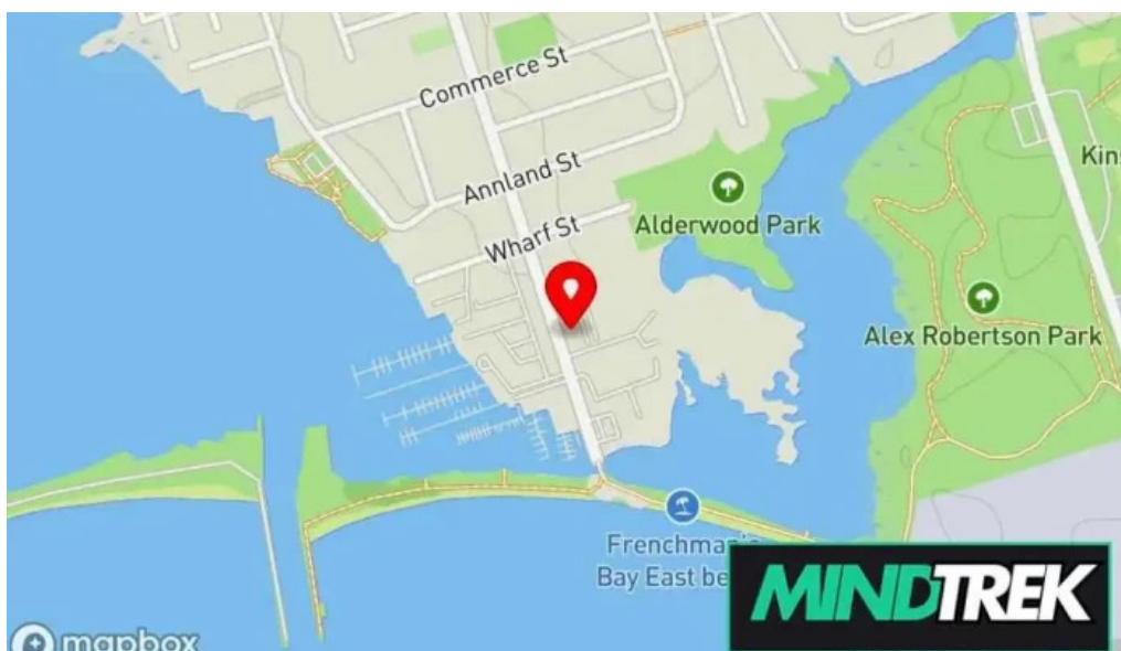
Pickering counseling centre map