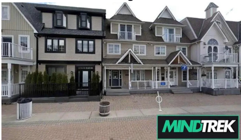
Pickering counseling centre pickering