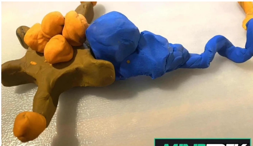
Expressive arts therapy ottawa by owner