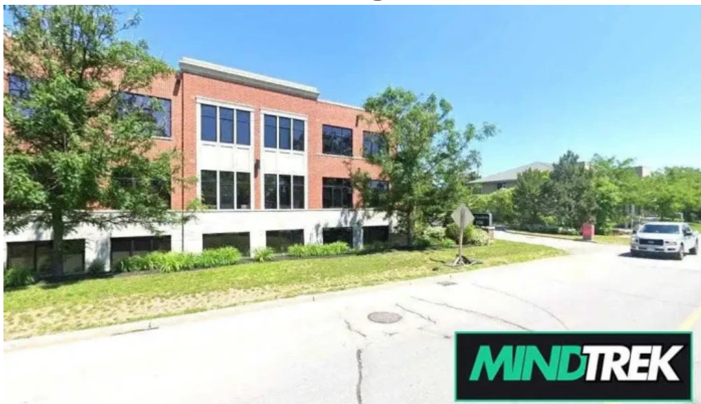
Expressive arts therapy ottawa ottawa