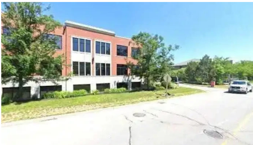
Expressive arts therapy ottawa all