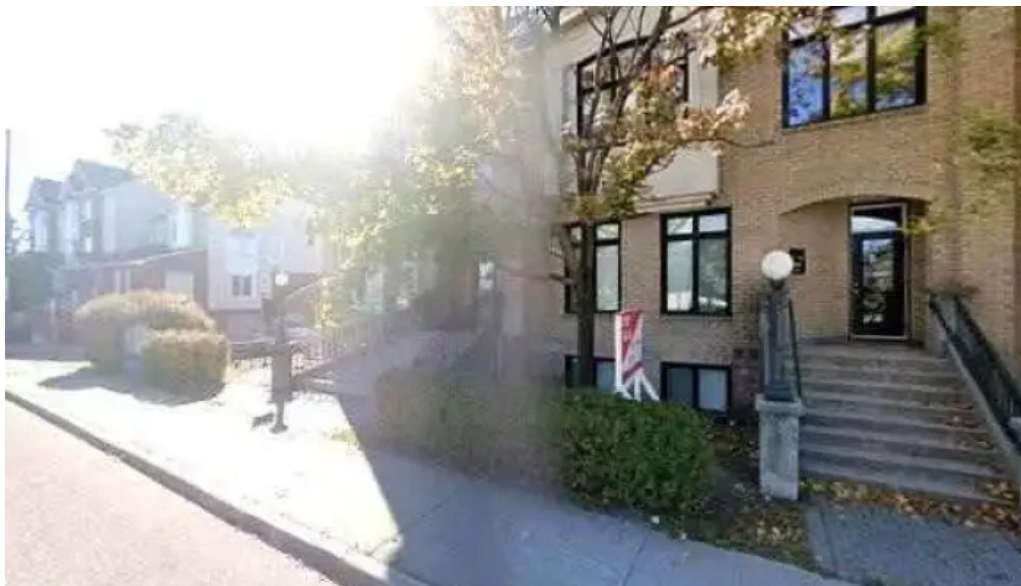
Amani therapy all