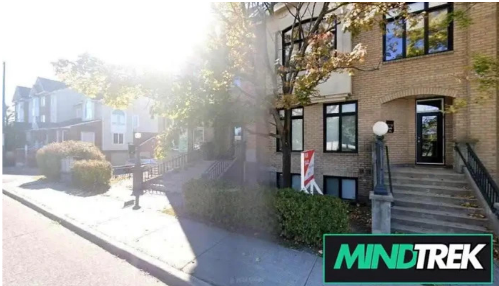
Amani therapy ottawa