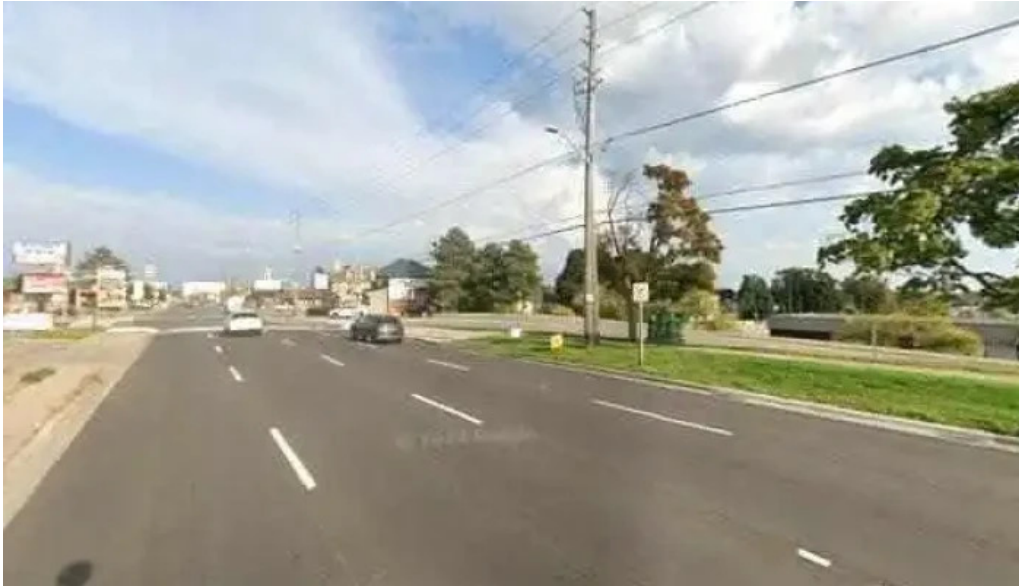
Lifetransitions counselling street view 360deg