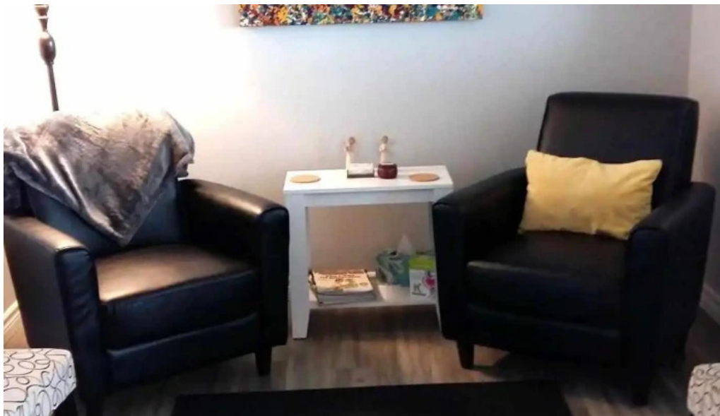
Lifetransitions counselling by owner