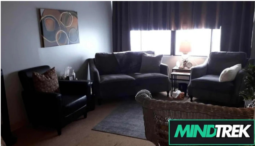
Lifetransitions counselling oshawa