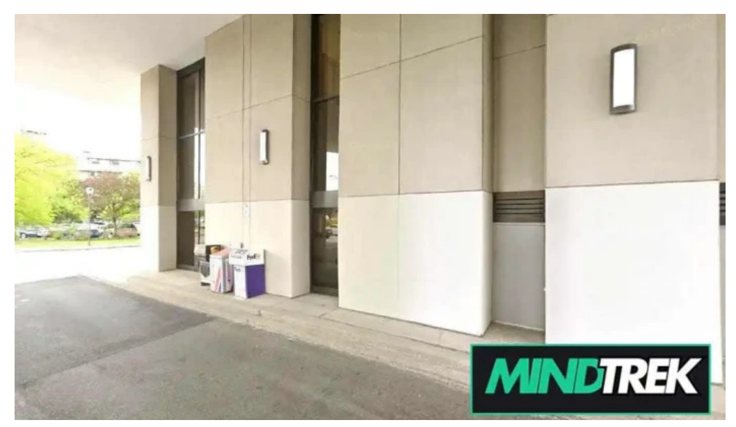
Increments psychotherapy ontario