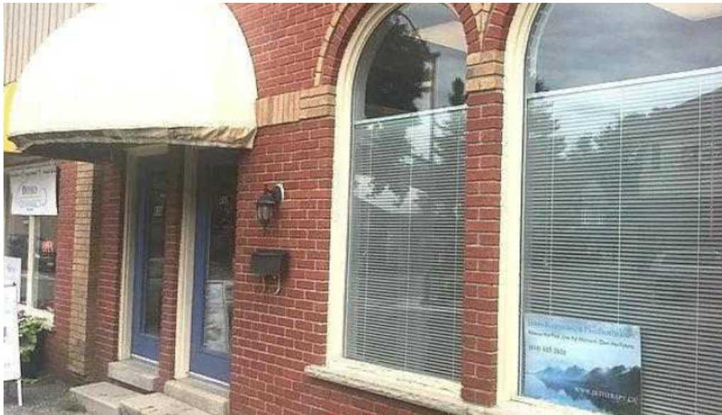
Newmarket therapy centre all