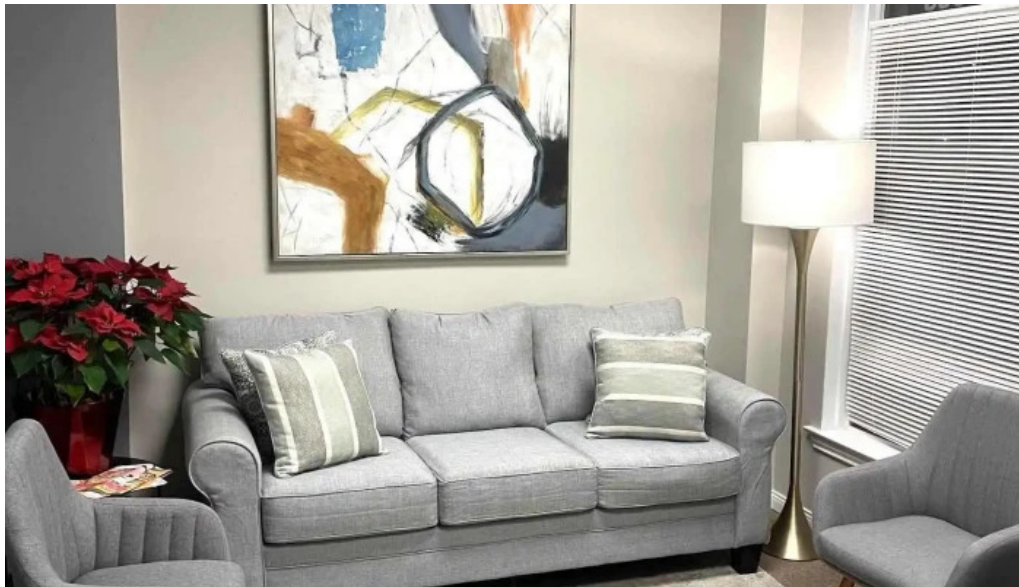
Newmarket therapy centre by owner