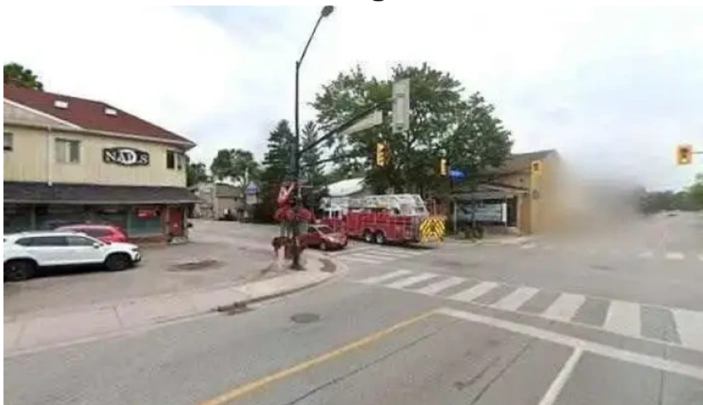
Newmarket therapy centre street view 360deg