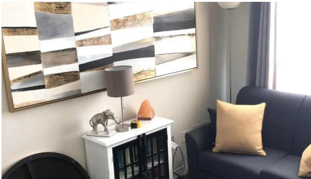
Newmarket therapy centre building