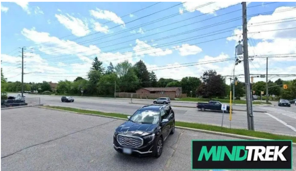
Juniper tree newmarket