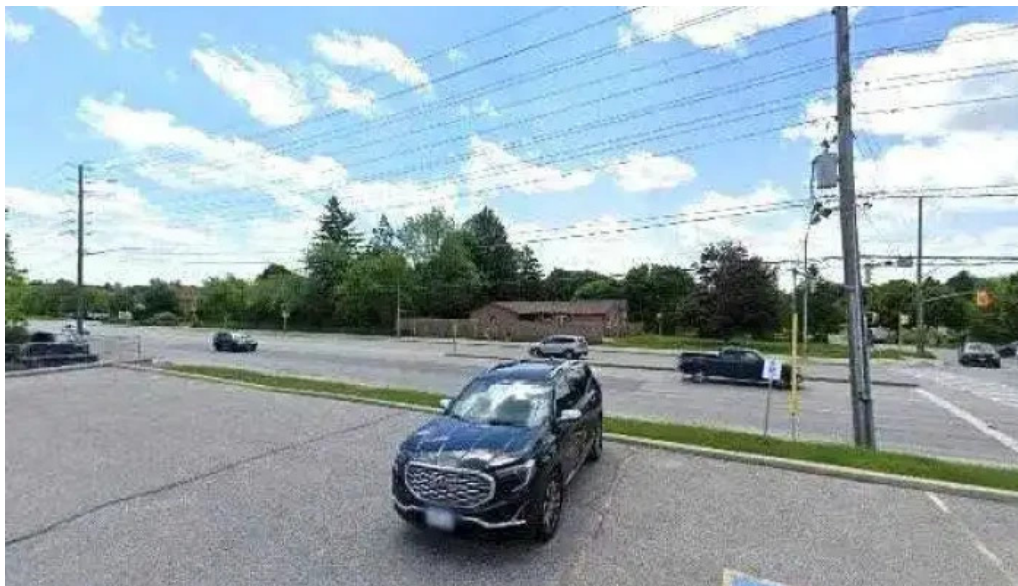
Juniper tree all