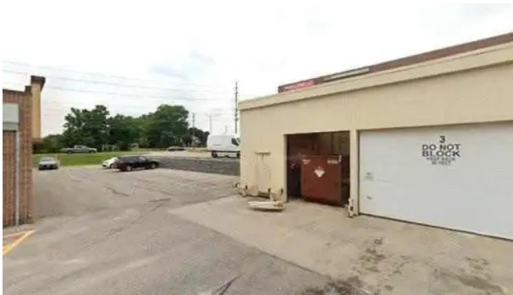
Joanne lechowicz therapy services street view 360deg