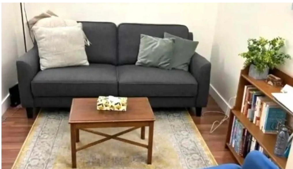
Joanne lechowicz therapy services newmarket