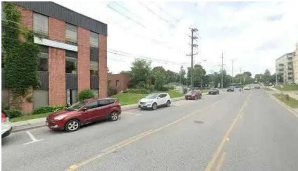
Dr karma guindon associates street view 360deg