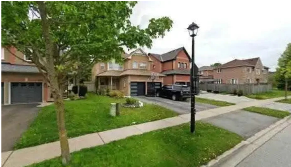
Claudine simone therapy all