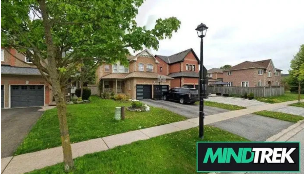
Claudine simone therapy newmarket