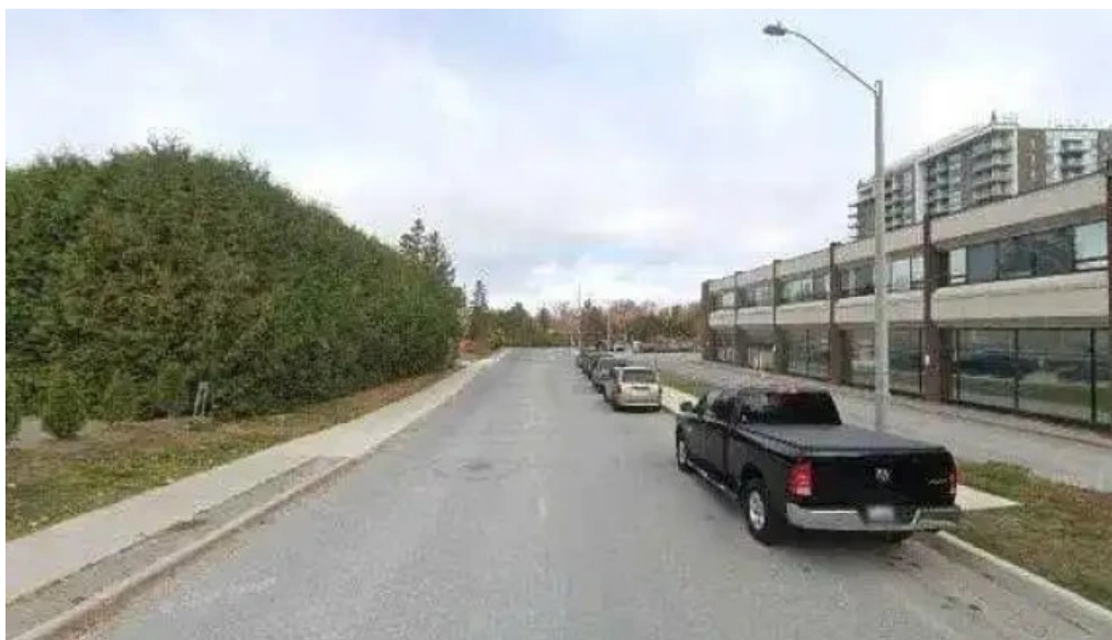
Genna pearce therapy all