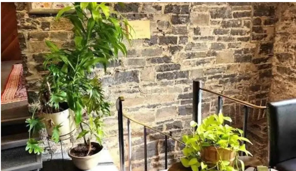
Compass psychotherapy david sider rp kingston