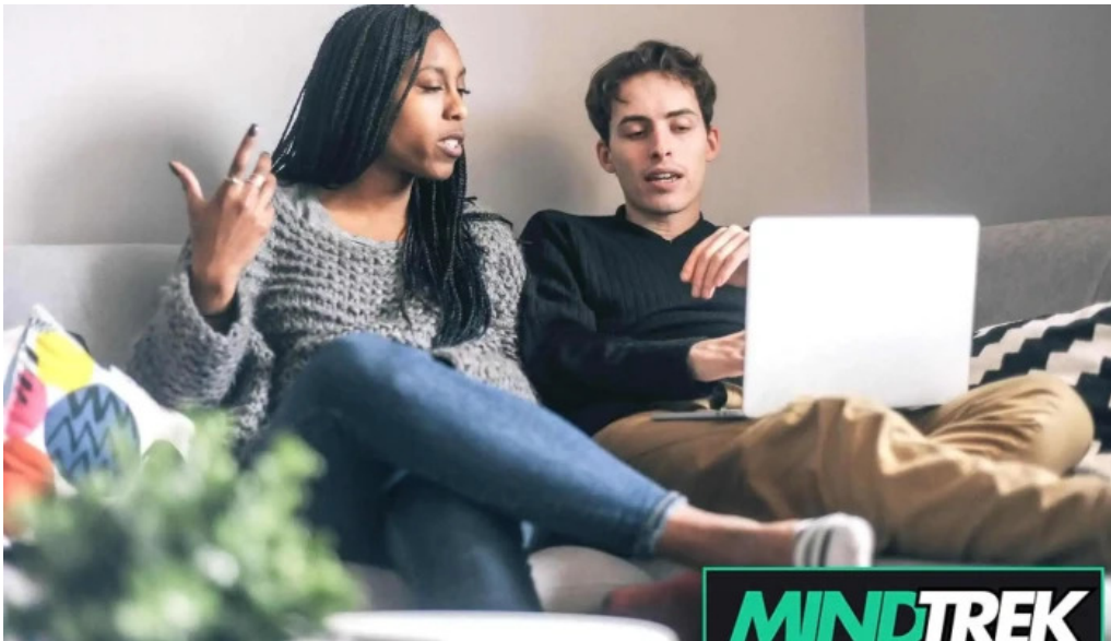
Couples counselling centre by owner