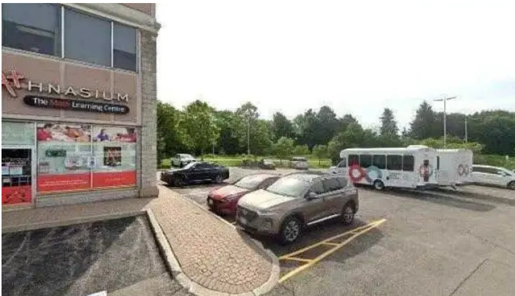
Couples counselling centre street view 360deg