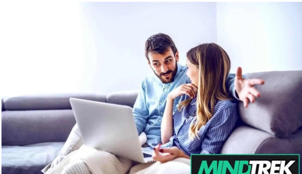
Couples counselling centre hamilton