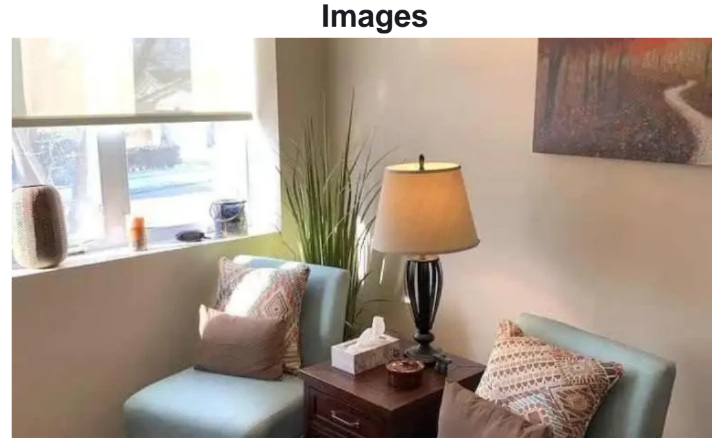
A new pathway counselling guelph

If you wish to alter any data that you believe is incorrect related to this portal, we ask forward a message and we will correct it promptly. With anticipation thanks for your cooperation.