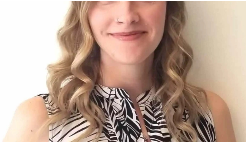
Wise hearts therapy emdr cbt therapist sudbury by owner