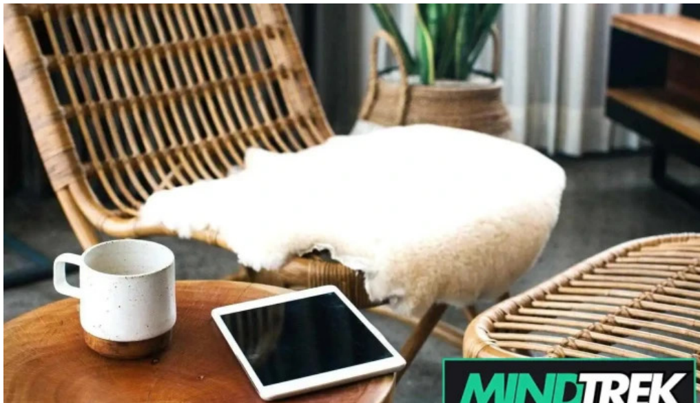
Wise hearts therapy emdr cbt therapist sudbury greater sudbury