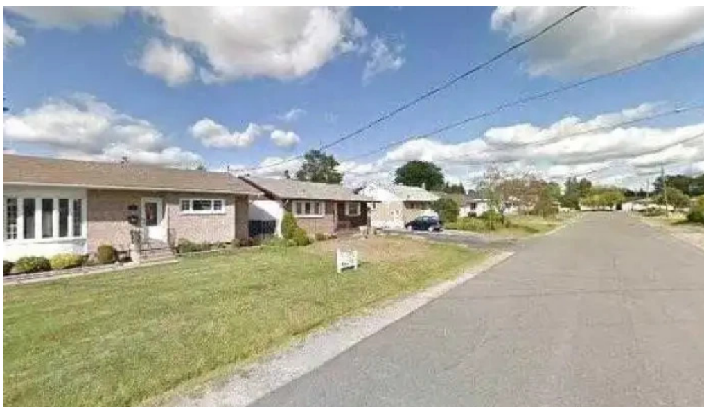
Wise hearts therapy emdr cbt therapist sudbury street view 360deg