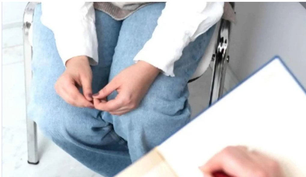
Wise hearts therapy emdr cbt therapist sudbury latest