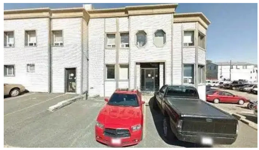
Tasha breau all