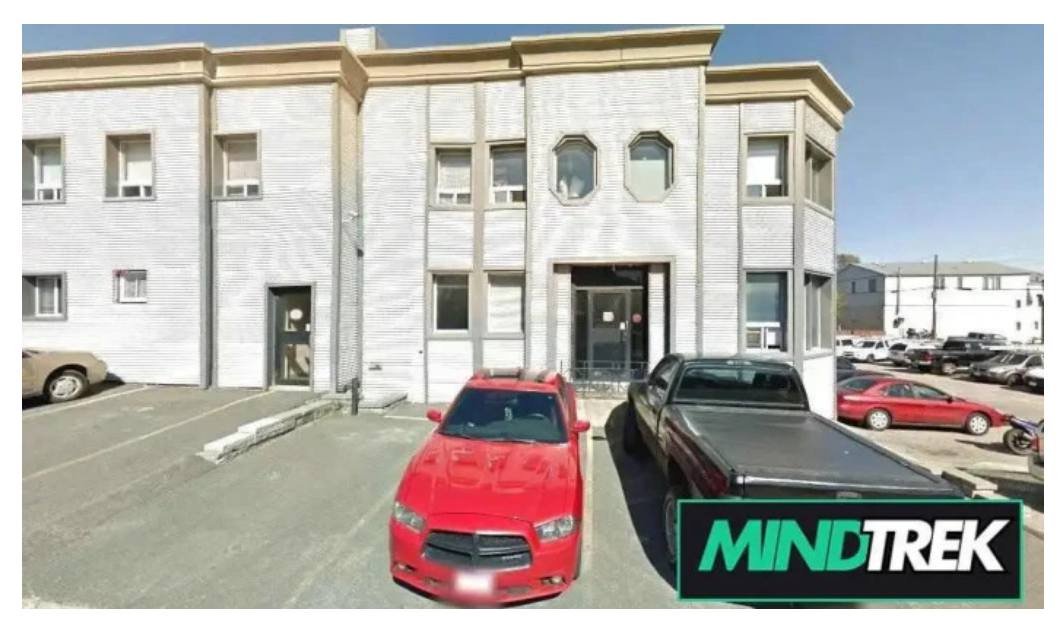
Tasha breau greater sudbury