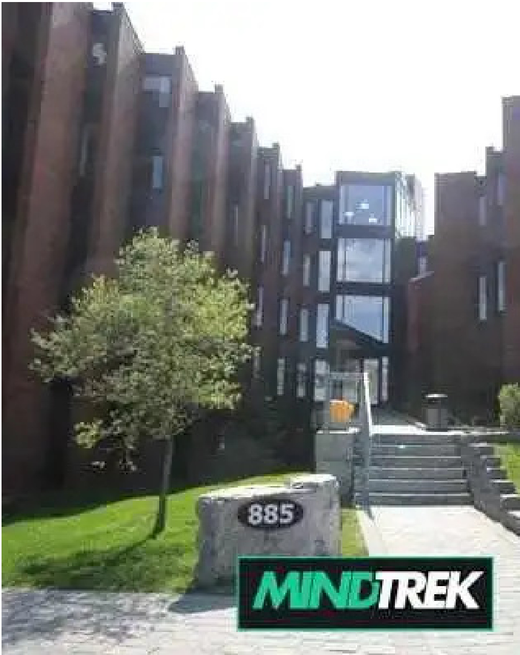
Sudbury therapy by owner