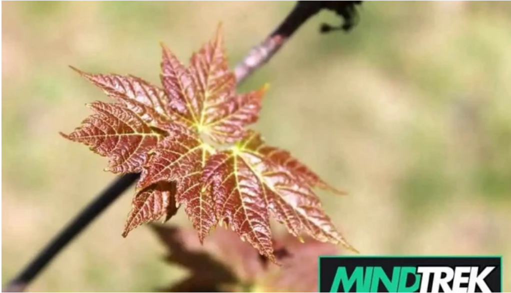
Sudbury therapy greater sudbury