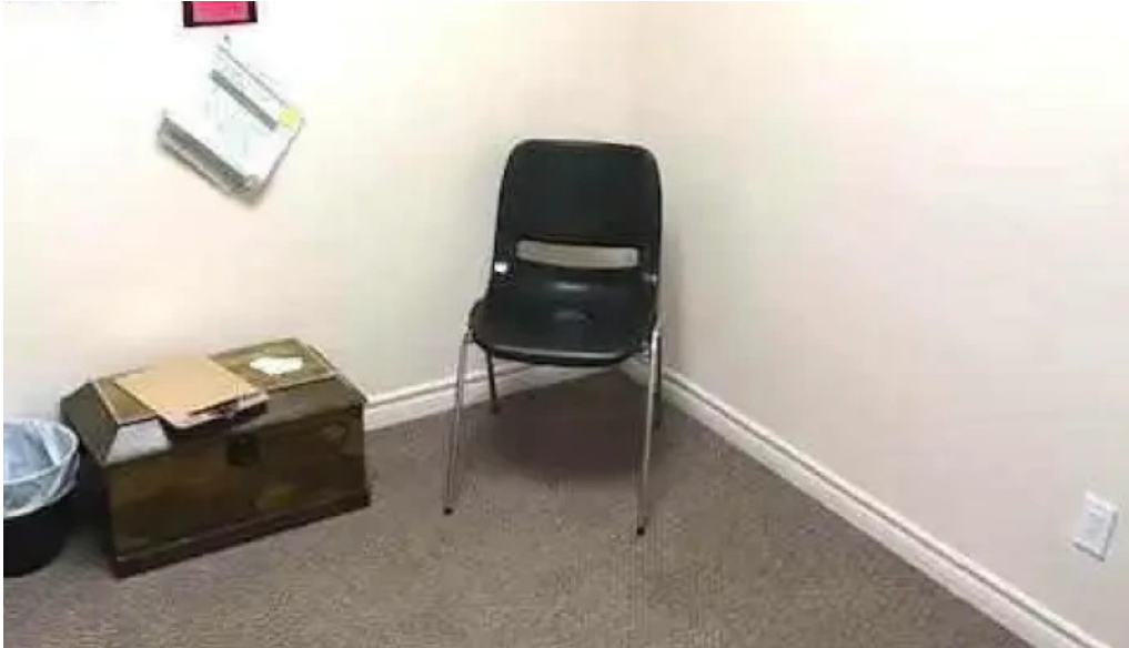
Advanced solutions counselling by owner