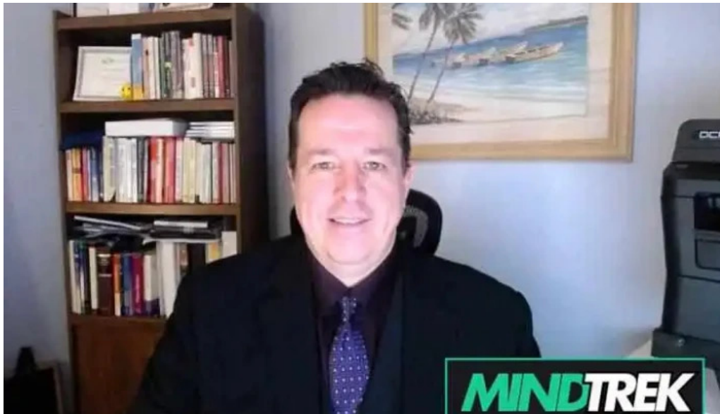
Advanced solutions counselling greater sudbury