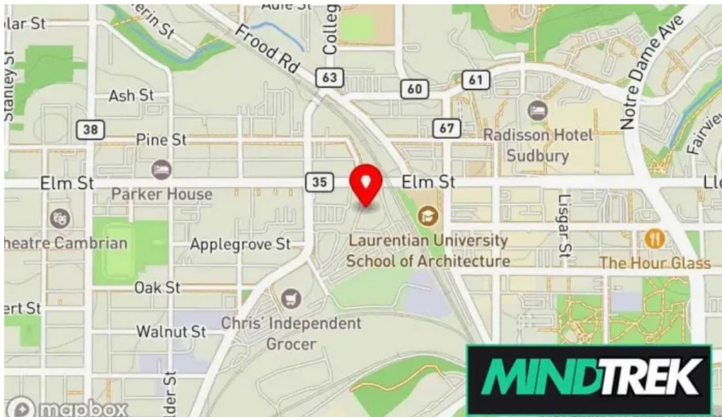
Advanced solutions counselling map