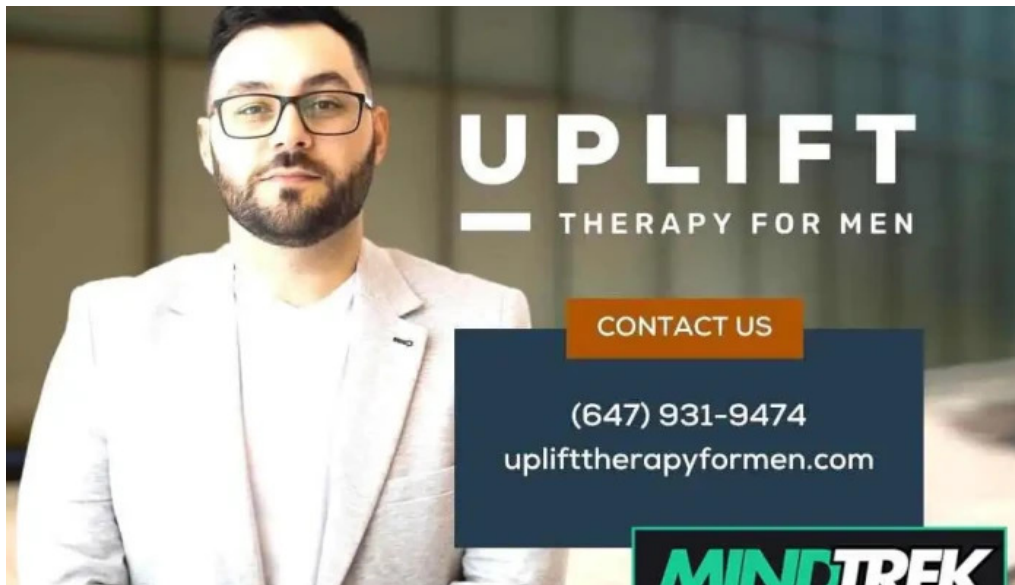
Uplift therapy for men etobicoke