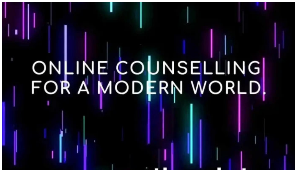
The dot canada collingwood