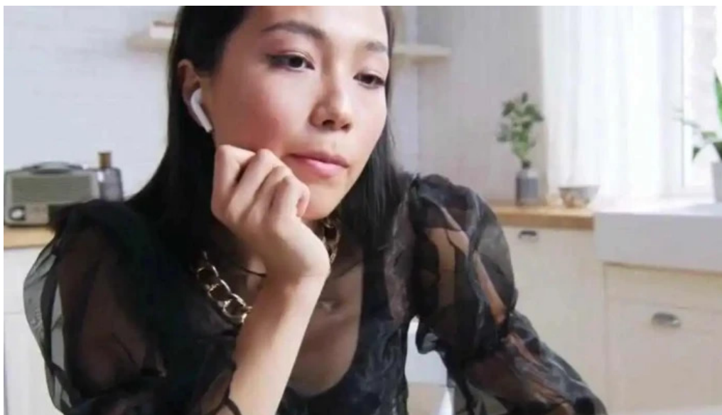
The dot canada by owner