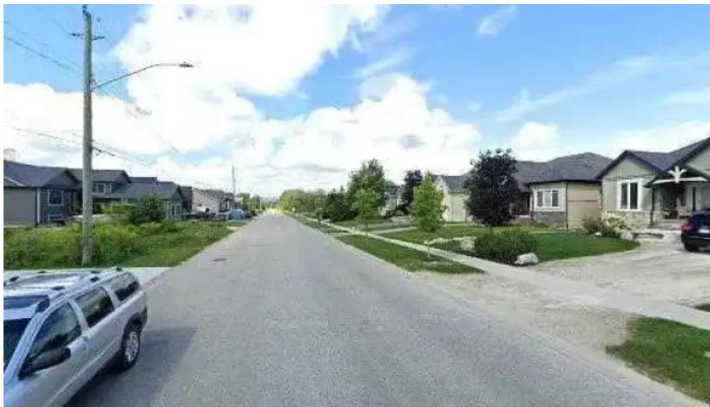
Mountain roots psychotherapy street view 360deg