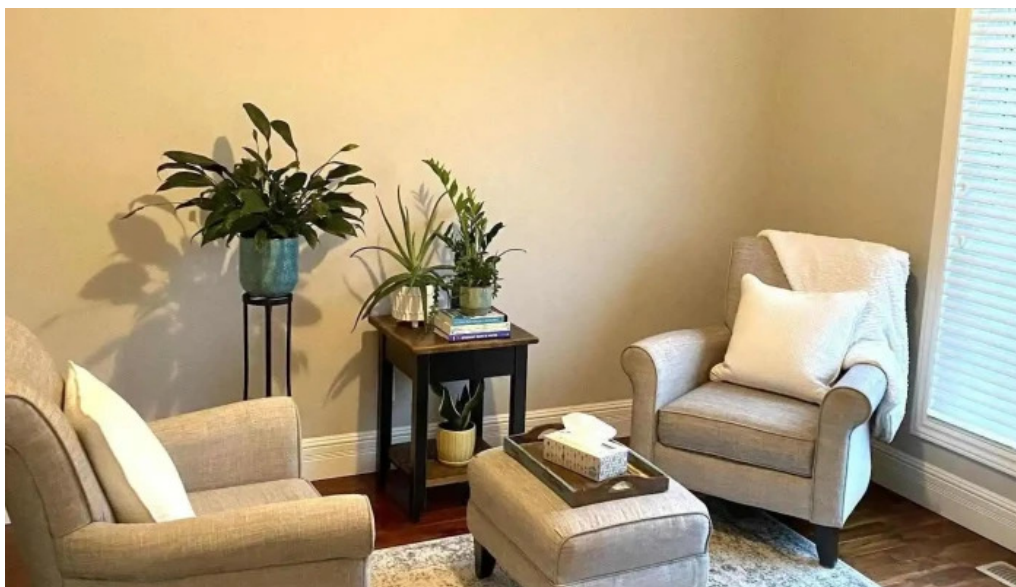
Mountain roots psychotherapy all