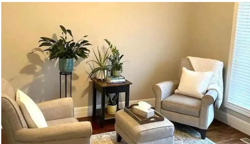
Mountain roots psychotherapy collingwood