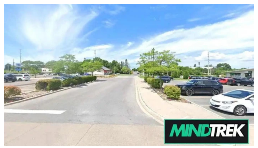
Gateway counselling solutions hypnosis cobourg