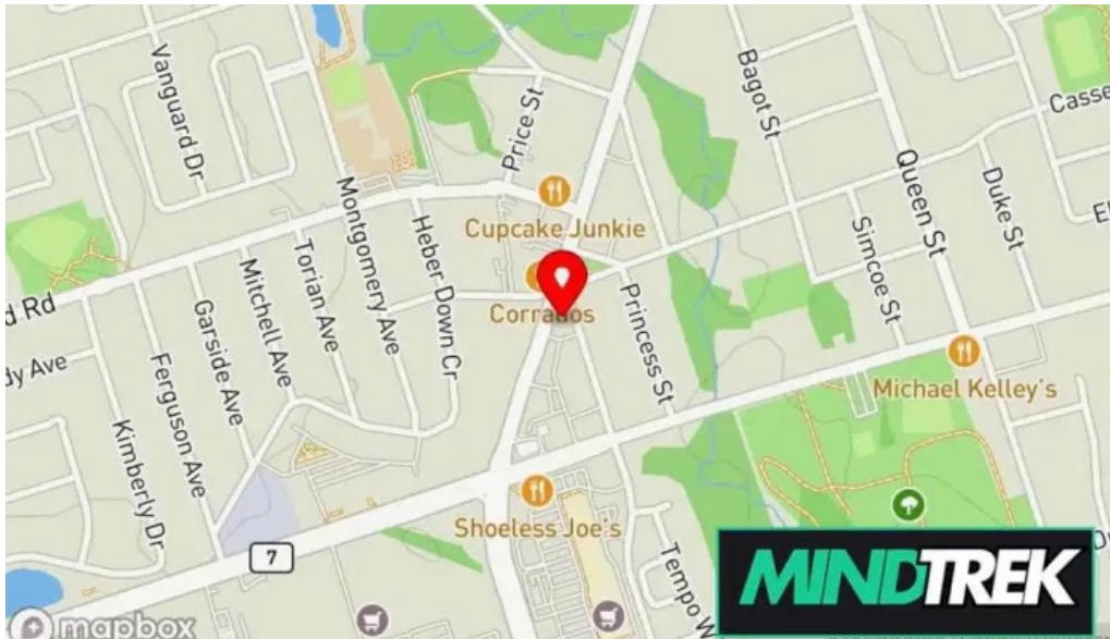
Vanessa robson therapy brooklins individual couples and family therapists map