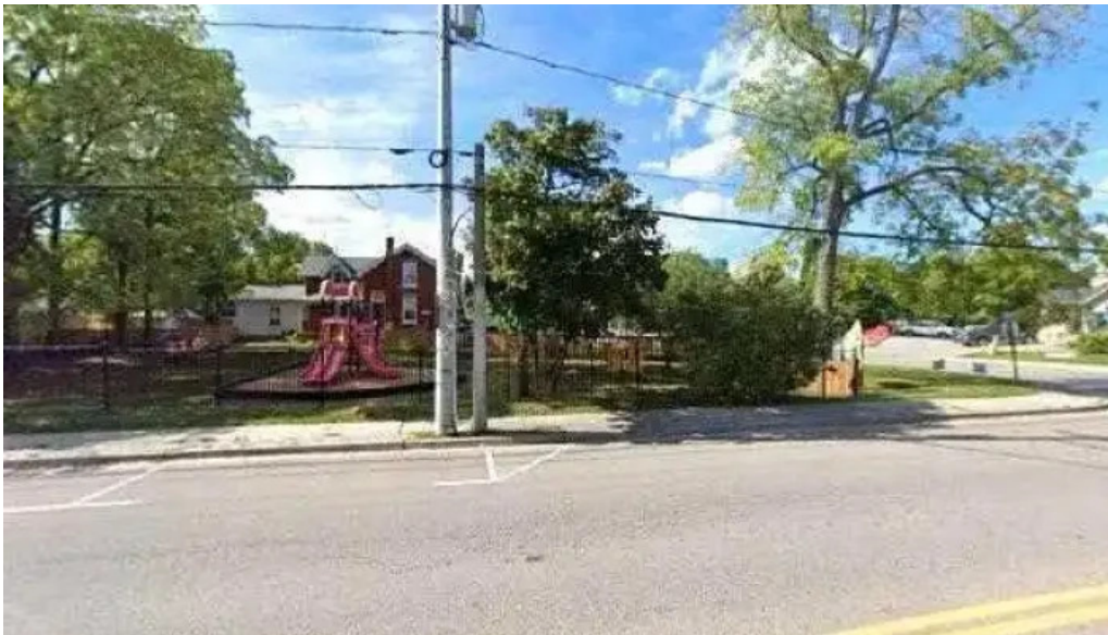
Vanessa robson therapy brooklins individual couples and family therapists street view 360deg