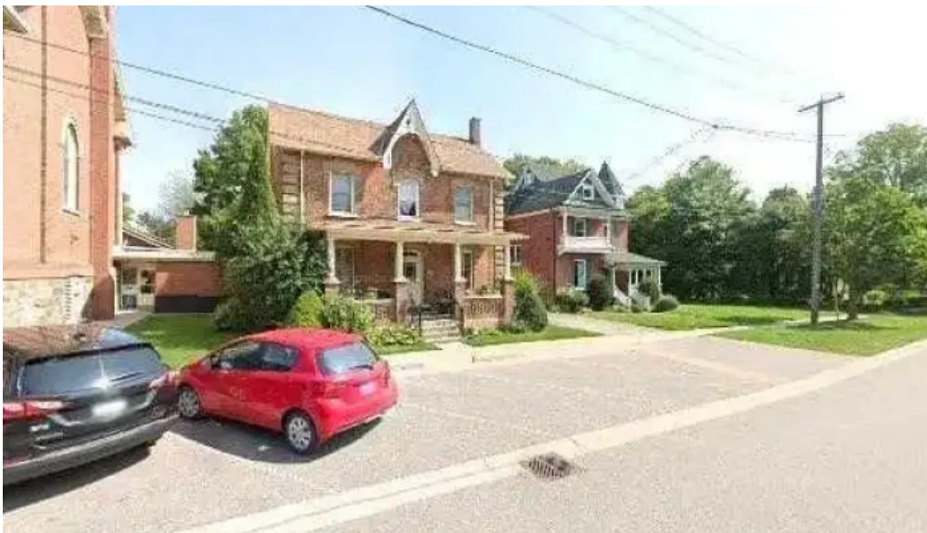
Cedar tree therapy street view 360deg