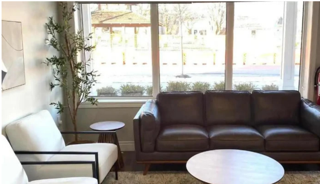
Cedar tree therapy by owner