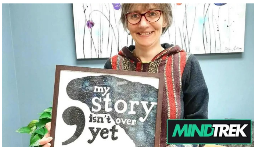
The story isn t over brampton