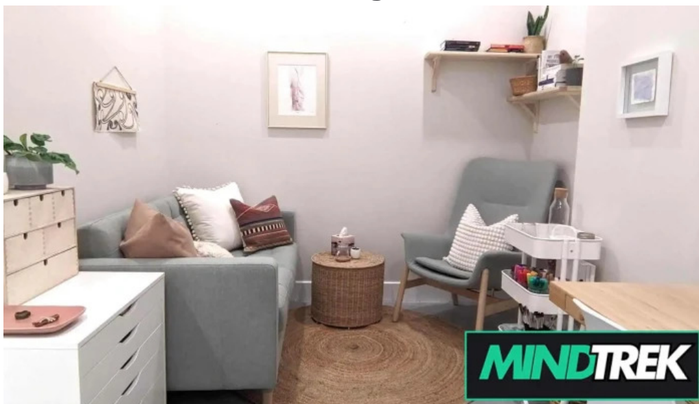
?io art therapy belleville