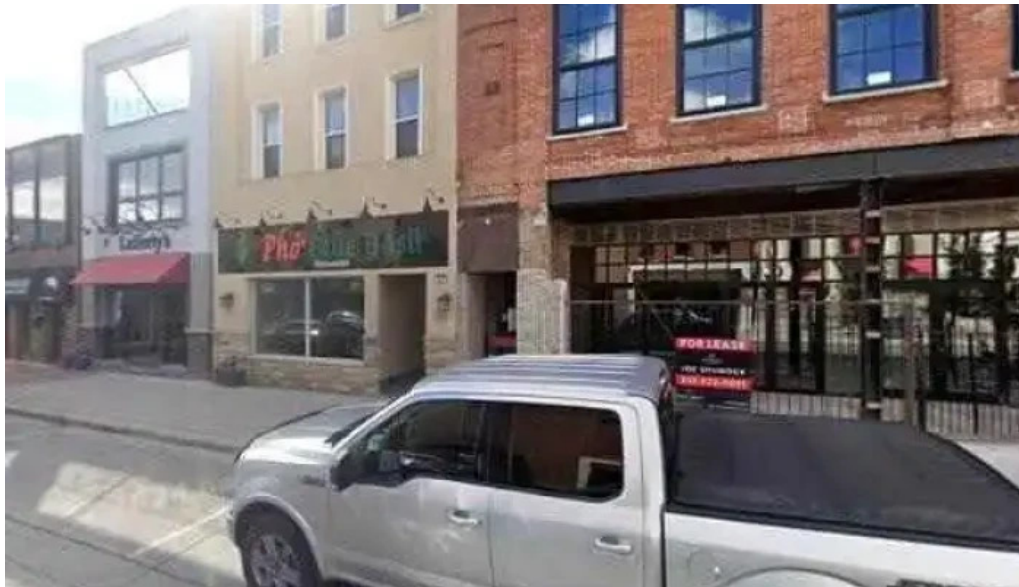
Aio art therapy street view 360deg