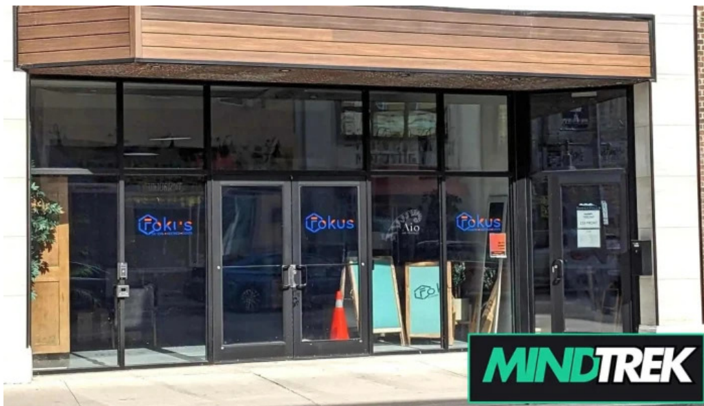
Aio art therapy building