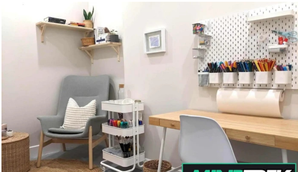
Aio art therapy by owner