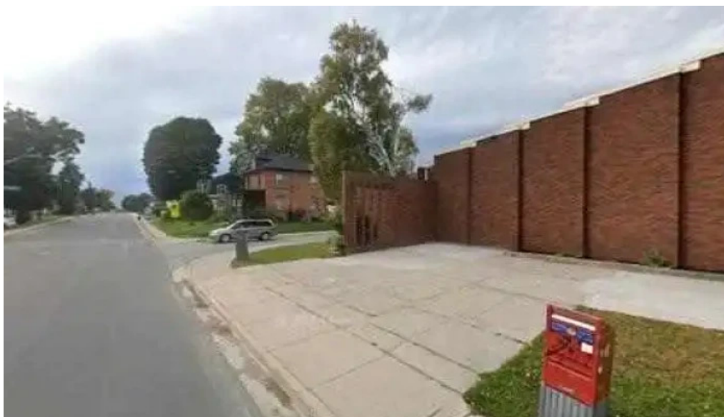
Meyers creek psychotherapy belleville all