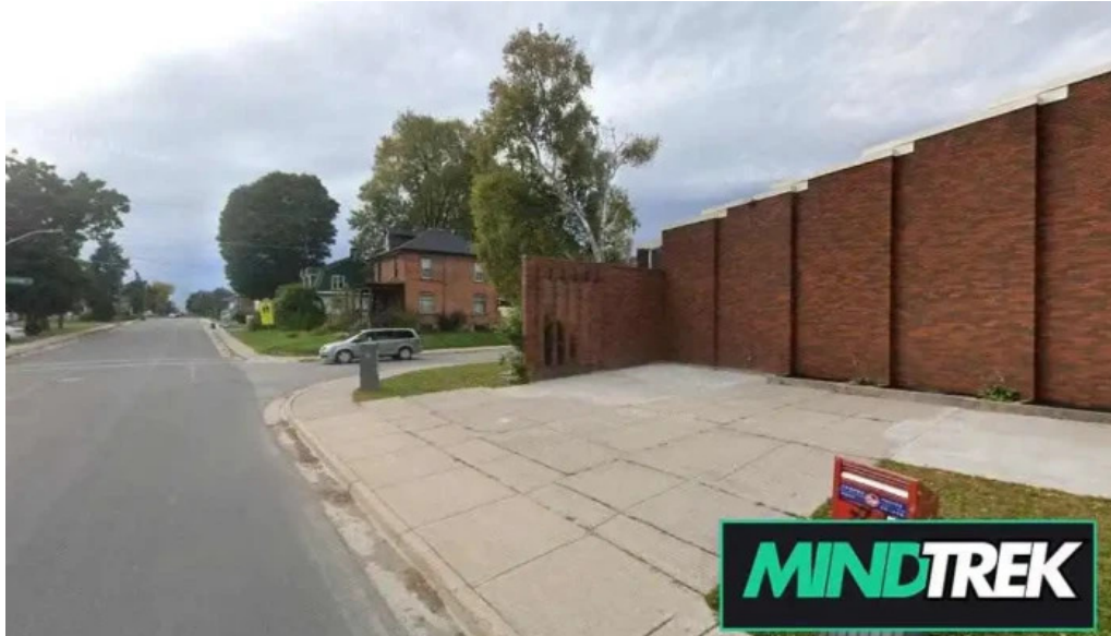
Meyers creek psychotherapy belleville belleville